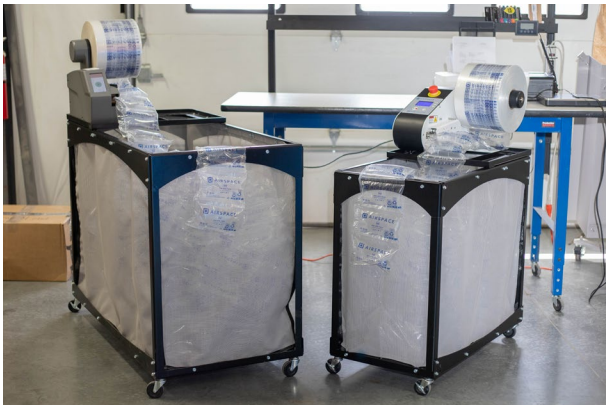
Rover Portable Cart, large and small