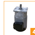
1/4 HP gear motors to process up to 65 lb cases