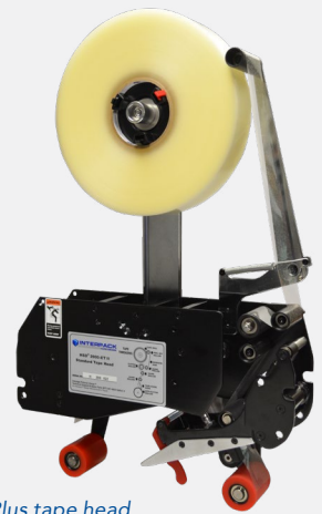
ET 2Plus tape head

When you compare features, benefits and value, Interpack Case Sealers are the right choice for operators, plant engineers, maintenance and purchasing.