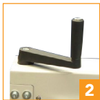
Threaded rod upper head lifting