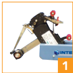
Tip-up tape head simplifies roll replacement