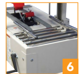
Horizontal self-centering in-feed guides