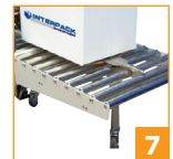
Optional 19" long pack tables available with pack horn