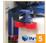
2-wheel top squeezer