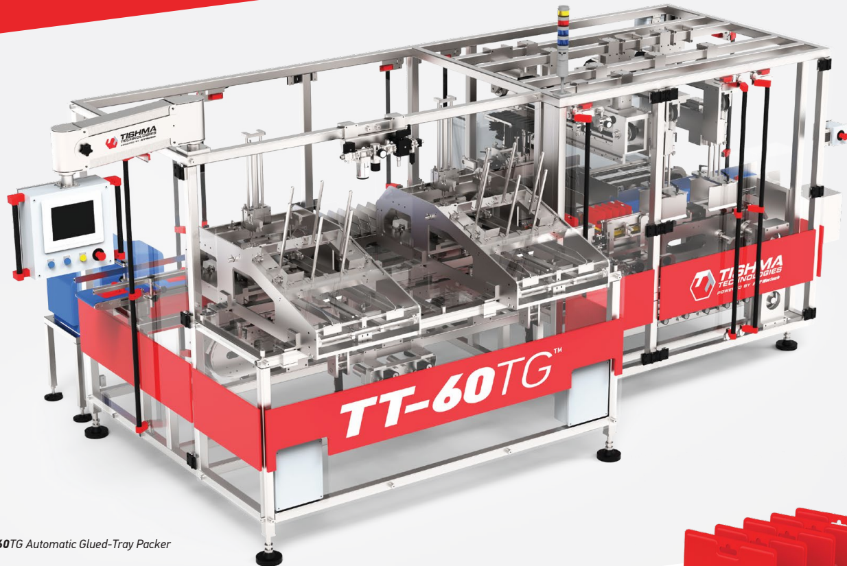
TT-60TG Automatic Glued-Tray Packer