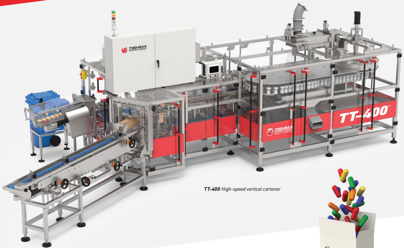
TT-400 High-speed vertical cartoner